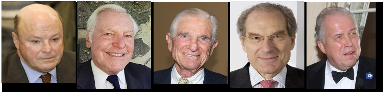
Frank G. Wisner