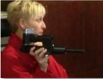
Figure 1: KGB surveillance camera used to spy on Living Sound teams while they stayed at the Hotel Viru, Tallinn, Estonia.