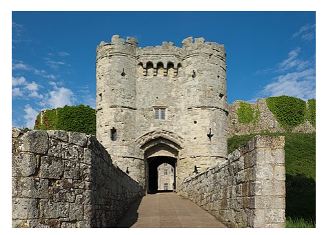
Carisbrooke Castle gatehouse

As part of the assertion of Norman control over England and Wales, FitzOsbern was one of the major Norman <u>castle</u> builders. Early castles attributed to him include <u>Carisbrooke Castle</u> on the Isle of Wight, Chepstow Castle (Striguil) in South Wales, Wigmore <u>Castle</u> and <u>Clifford Castle</u> in Herefordshire, <u>Berkeley Castle</u> in <u>Gloucestershire</u> and <u>Monmouth Castle</u> in Wales. FitzOsbern also created or improved <u>fortifications</u> in the towns of <u>Hereford</u> and Shrewsbury.