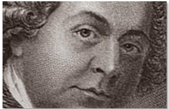
Figure 1: John Adams (1778): “The moment the idea is admitted into society that property is not as sacred as the laws of God, and that there is not a force of law and public justice to protect it, anarchy and tyranny commence. If ‘Thou shalt not covet’ and ‘Thou shalt not steal’ were not commandments of heaven, they must be made inviolable precepts in every society before it can be civilized or made free.

Nip the shoots of arbitrary power in the bud is the only maxim which can ever preserve the liberties of any people.”