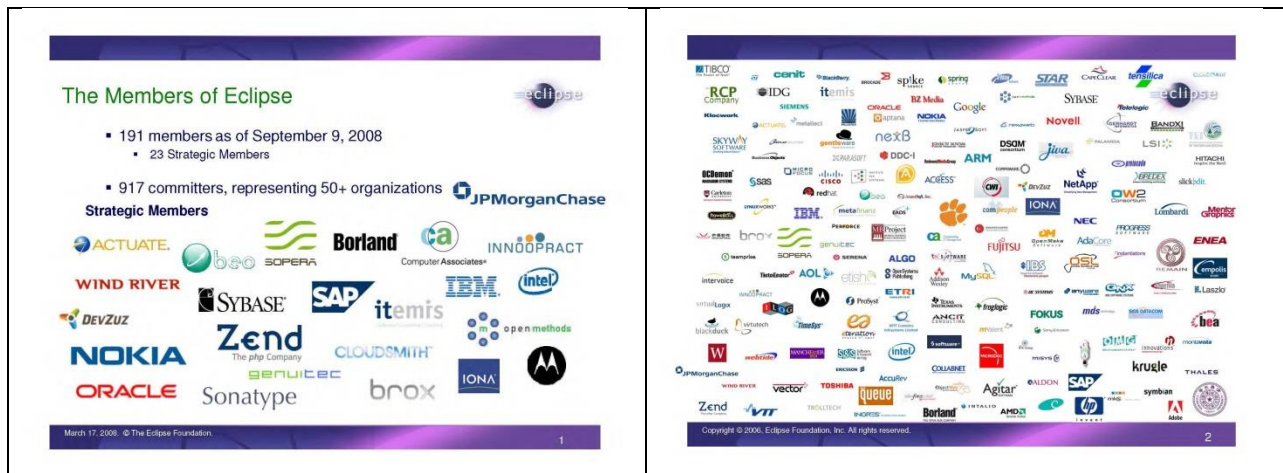
Figure 2: The Eclipse Foundation (Sep. 09, 2008) . Membership Logos [Board minutes]; See also The Eclipse Foundation (Sep. 17, 2008) . The Members of Eclipse, Minutes of the Eclipse Board Meeting, Sep. 17, 2008; AFI . (Jan. 15, 2015). IBM plots digital control with federal judges; steals inventions, p. 6. See also, Sep. 09, 2008 .

Here is the list of the IBM Eclipse Foundations' 2007 braggart corporations who stole and exploited the social networking inventions of Columbus innovator Leader Technologies.