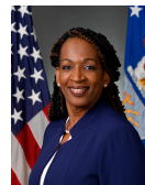
Venice Goodwine Air Force Deputy Chief Information Officer, Department of the Air Force