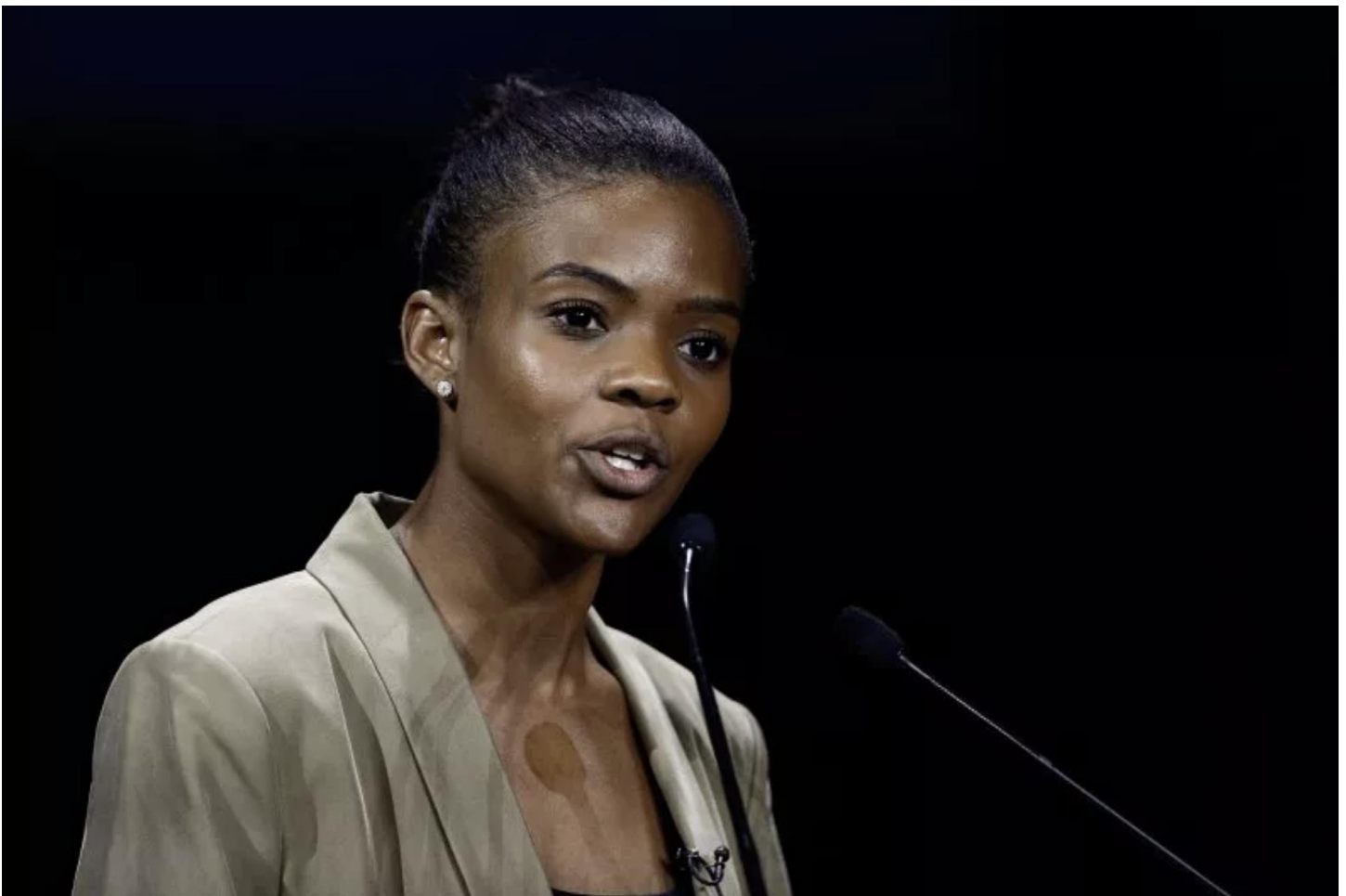
Conservative commentator Candace Owens delivers a speech during the Convention de la Droite in Paris on September 28, 2019.

Much of Owens' authored content on the site was not entirely politically focused, but she did write one post critiquing the Republican Party in 2015 before announcing on YouTube in 2017 that she had become a conservative.