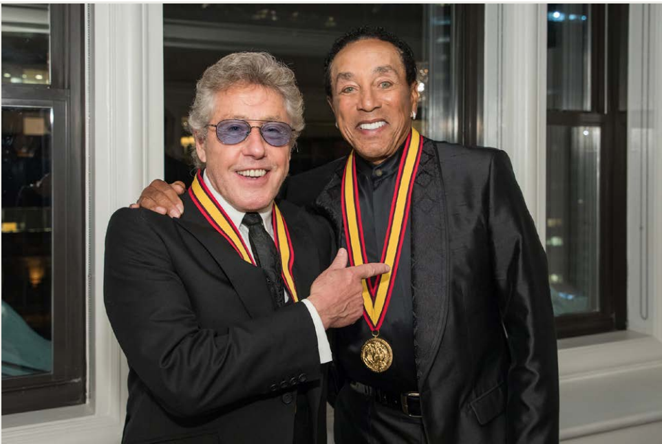
Roger Daltrey, the lead singer of The Who, greets a friend and fellow honoree, Motown legend Smokey Robinson.

Noting that in the United States, the private sector is four times larger than government and 40 times larger than philanthropy, he proposed a model of “venture philanthropy” based on Andy Grove and John Doerr’s concept of OKR. To create an index of social responsibility for the socially conscious investor, he found that given a choice, people are drawn to companies they believe serve the interests of employees, customers, communities, and the planet.