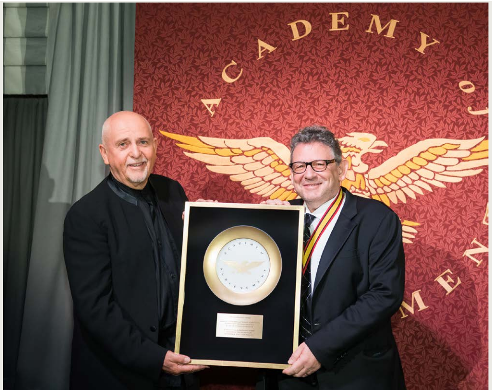
Singer, songwriter and humanitarian Peter Gabriel presenting the Golden Plate Award to Sir Lucian Grainge, the Chairman and CEO of Universal Music Group, during the 53rd International Achievement Summit in New York City.

Supreme Court Justice Brett Kavanaugh began his address by joking, “When I was invited, I said I would only come if I could follow Pitbull.” The Justice spoke warmly of teachers and mentors who had the greatest influence on him. As a recent law school graduate, Kavanaugh clerked for Justice Anthony M. Kennedy, and he praised Justice Kennedy’s deep learning as well as his example of unfailing civility on the bench.