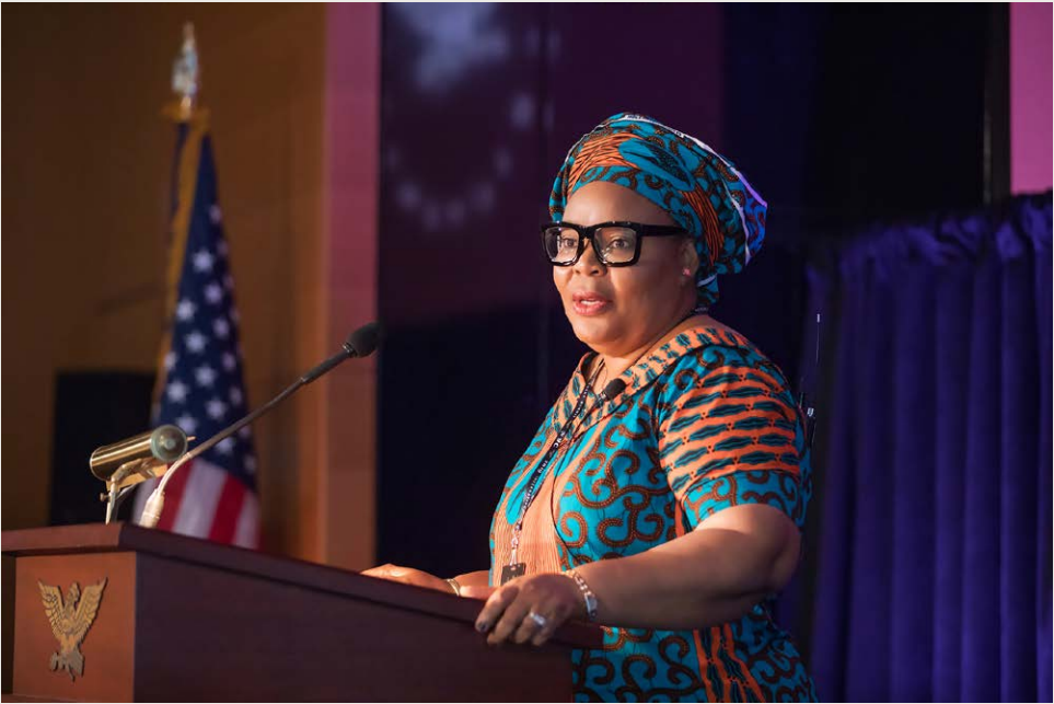
Leymah Gbowee of Liberia, the recipient of the Nobel Peace Prize, addresses Academy delegates and members at a symposium at Four Seasons Hotel during the 53rd annual International Achievement Summit in New York City.