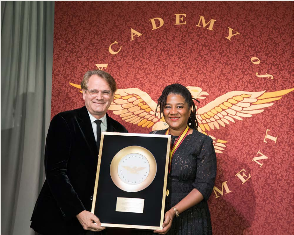
Tony Award-winning theater director Bartlett Sher presenting the Golden Plate Award to Lynn Nottage, Pulitzer Prize-winning playwright, at the Banquet of the Golden Plate Award ceremonies at the St. Regis in New York City.

Stevenson’s law practice has focused on the disproportionate prosecution and sentencing of impoverished Americans and defendants of color. The number of incarcerated Americans has grown from 300,000 to 2.2 million since 1972, he observed, and the United States now has more imprisoned citizens than any country in the world. It is estimated that one in every three African American males will face the prospect of incarceration at some point in their lives. His organization, the Equal Justice Initiative, has won major legal challenges to unjust and excessive sentencing in criminal cases.