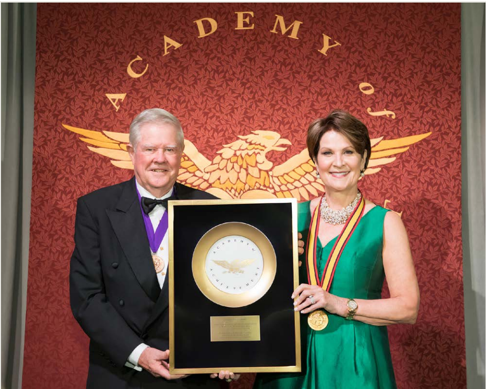
General Joseph W. Ralston, USA, former Supreme Allied Commander Europe, presents the Golden Plate Award to Marilyn A. Hewson, the Chairman, President and CEO of Lockheed Martin, at the Banquet of the Golden Plate gala.