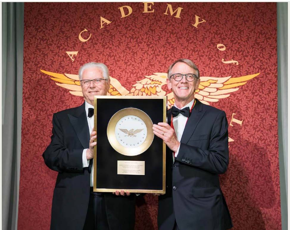
Summit Co-Host Stefano Pessina, CEO of Walgreens Boots Alliance, presents the Golden Plate Award to investor and famed venture capitalist John Doerr at the Banquet of the Golden Plate gala ceremonies at the St. Regis Hotel.

The fantastically imaginative designer Thomas Heatherwick gave a detailed illustrated presentation of his work. As a student, he became frustrated with the uniformity of modern architecture and set out to build something new and more interesting himself, although he had no formal training in architecture. Following his own axiom, “It’s better to be weird than boring,” he designed what described as “a giant tent” made of solar panels. As an example of his innovative design process, he demonstrated how he repurposed a complex of 90-year-old grain silos in Cape Town, South Africa into the building that now houses the city’s Zeitz Museum of Contemporary Art.