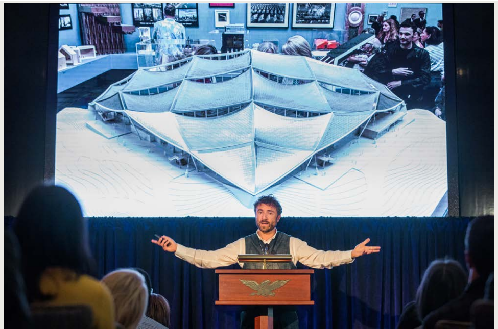
Thomas Heatherwick shows his design for Google's new campus in Mountain View, California. Elaborate tent-like structures of concave photovoltaic panels (PV) form a billowing canopy over the flexible workspaces and gardens.

Attorney, author and entrepreneur Dr. Martine Rothblatt reflected on her extraordinarily varied career. The founder of the SiriusXM satellite radio system, she created a biotechnology company to find a cure for her daughter's lung disease, which has since saved the lives of thousands around the world. As an attorney and author, Dr. Rothblatt has also been a successful advocate for the rights of the transgendered and is the author of visionary works on the subjects of xenotransplantation and cyber ethics. She reflected on the extraordinary good fortune of the present generations of men and women in comparison with the centuries of poverty and serfdom that most of their ancestors endured. She urged the Academy's delegates to "use the skills you have to make life better for others," and imagined the spirits of those long-dead ancestors saying, "For God's sake, enjoy your life."