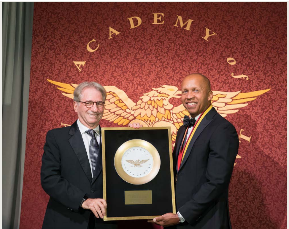
Barry Scheck, the Co-Founder of the Innocence Project, presenting the Golden Plate Award to Bryan Stevenson, Founder and Executive Director of Equal Justice Initiative, a human rights organization in Montgomery, Alabama.

Another tale of perseverance in the face of even more extraordinary challenges was told by the next speaker, Leymah Gbowee, a recipient of the Nobel Prize for Peace. Gbowee successfully mobilized the women of Liberia to force the nation's warlords to negotiate a peaceful settlement to the country's brutal civil war. She recalled the enormous difficulties she had to overcome to pursue higher education in the United States, a world away from the simple village life she had known in Liberia. She has since assisted many young women from her country to travel the same road. With great humor and warmth, she recalled her experience traveling on an airliner in the United States, casually dressed among well-dressed businesspeople, and their astonishment when she received a message informing her that she had won the Nobel Prize.