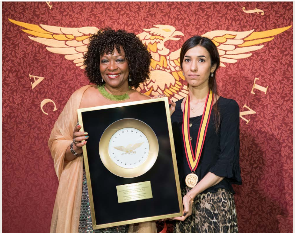
Rita Dove, former United States Poet Laureate, presenting the Golden Plate Award to Nadia Murad, recipient of the Nobel Prize for Peace, during the Banquet of the Golden Plate Award gala at the St. Regis Hotel in New York City.

Nadia Murad, a recipient of the 2019 Nobel Prize for Peace, is a Yazidi woman who was kidnapped by ISIS in Iraq and escaped to become an advocate for survivors of war crimes and human trafficking. When asked who inspires her, she says that everyone she meets inspires her. The world leaders she meets fall into two categories: those who understand her story empower her in her work, and those who cannot understand her story inspire her to continue, “Because I can’t let them decide our fate.”