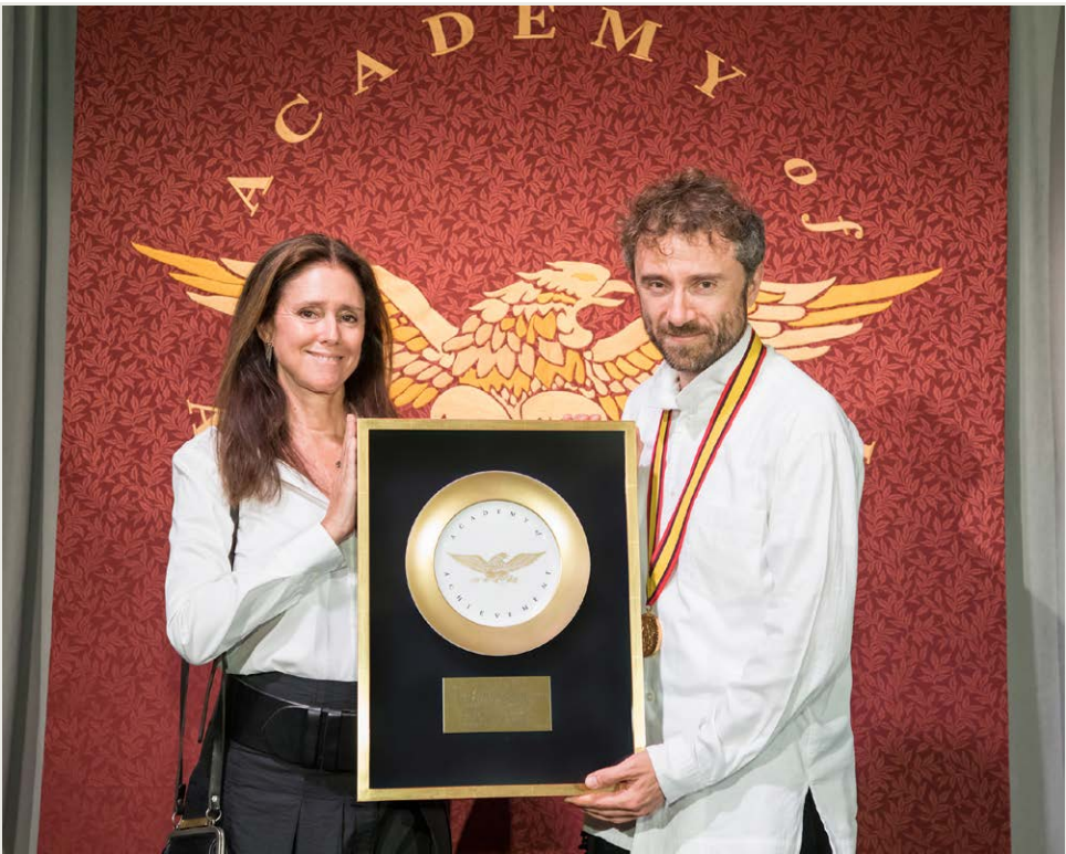
Tony Award-winning film and theater director Julie Taymor presenting the Golden Plate Award to British designer Thomas Heatherwick at the Academy of Achievement's 53rd International Achievement Summit in New York City.