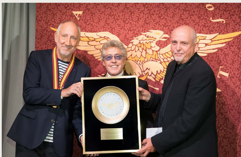
Members of the Rock and Roll Hall of Fame: Peter Gabriel presenting the Golden Plate Award to The Who's Pete Townshend and Roger Daltrey at the Banquet of the Golden Plate ceremonies during the Achievement Summit.