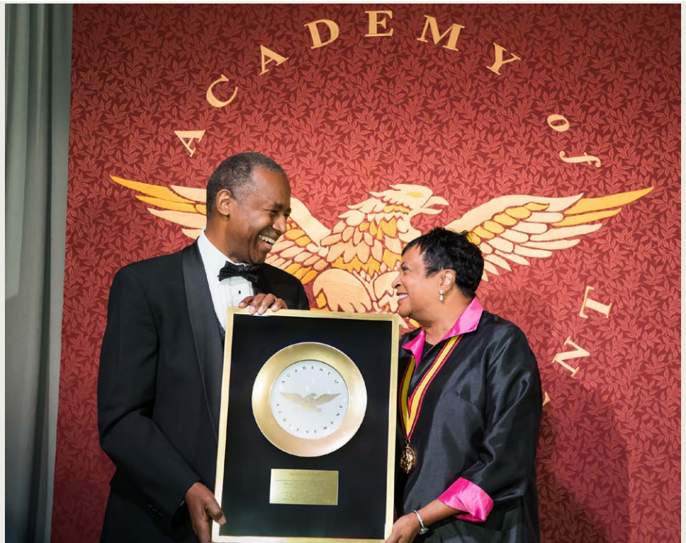
Dr. Benjamin S. Carson, United States Secretary of Housing and Urban Development, presents the Golden Plate Award to Dr. Carla Hayden, the Librarian of Congress, at the Banquet of the Golden Plate Award gala ceremonies.

The realms of literature and journalism were represented by distinguished Academy members, including a recipient of the Nobel Prize for Literature, novelist Orhan Pamuk, and the award-winning British novelist Ian McEwan.