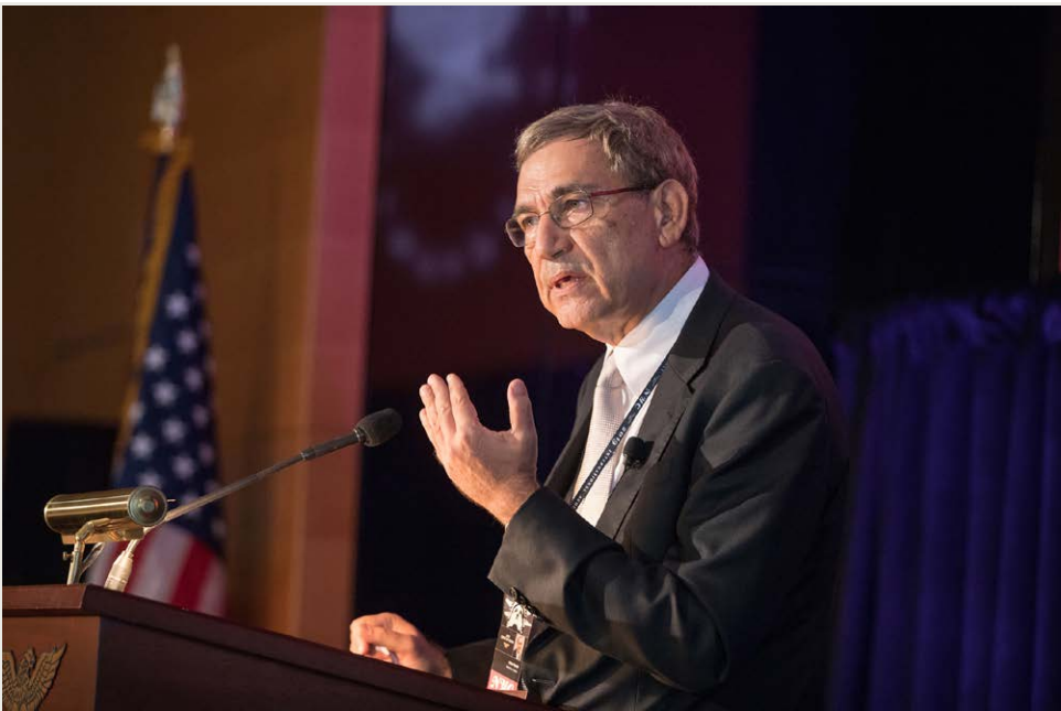
Bestselling Turkish novelist Orhan Pamuk, a recipient of the Nobel Prize in Literature, affirms his faith in literature at a symposium session at the Four Seasons Hotel in New York City during the International Achievement Summit.

The next speaker of the morning was author T.J. Stiles, who received the Pulitzer Prize for Biography for The First Tycoon , a life of railroad magnate Cornelius Vanderbilt, and the Pulitzer Prize for History for his book Custer’s Trials , on the life of the controversial Civil War general who died at the Little Bighorn. In recounting his own trials, Stiles recalled the words of his revered martial arts master, who told him, “If you want to climb to the top, you have to cry the whole way.”