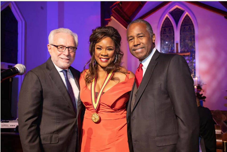
2019: CNN news anchor Wolf Blitzer and Secretary of Housing and Urban Development, Dr. Ben Carson, presenting the Academy's Gold Medal to mezzo-soprano Denyce Graves at Trinity Episcopal Church in Washington, Virginia.

In the last weeks of 2019, two more distinguished honorees were inducted into the Academy during a festive holiday celebration in the historic village of Washington, Virginia, at the foot of the Blue Ridge Mountains.