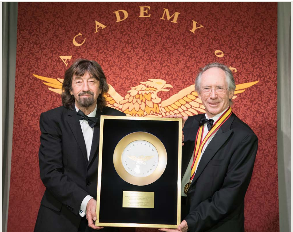
Theatrical director Sir Trevor Nunn presents the Golden Plate Award to award-winning novelist and screenwriter Ian McEwan at the Banquet of the Golden Plate gala ceremonies during the International Achievement Summit.

He enjoyed some good-natured jabs at his own industry. “The beautiful thing about the music business is half of them don’t know music and half of them don’t know business.” He also discussed the charter school he has created, with its Sports, Leadership, Arts and Management (SLAM) curriculum. Recalling the struggles of his forebears, he quoted the Cuban aphorism “ Pasos cortos, visión larga ” — “Short steps, long vision.”