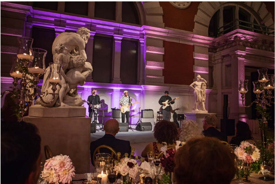
American Academy of Achievement members and guests listen as Buddy Guy, a titan of the blues, performs on stage in the Carroll and Milton Petrie European Sculpture Court at The Metropolitan Museum of Art in New York.