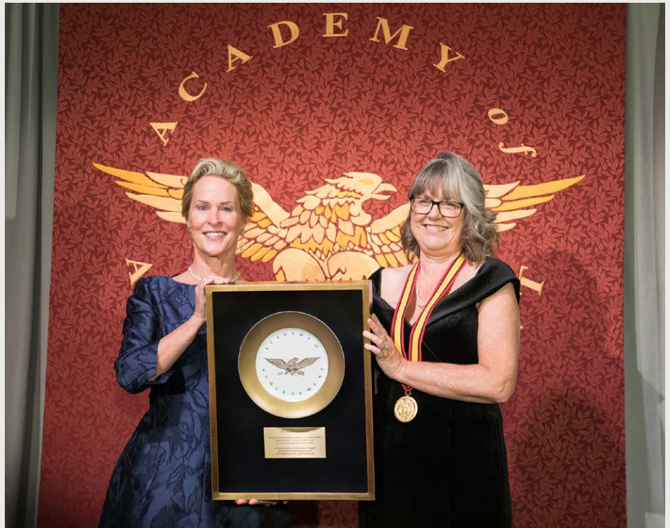
Dr. Frances H. Arnold, the recipient of the Nobel Prize in Chemistry, presents the Golden Plate Award to Dr. Donna Strickland, recipient of the Nobel Prize in Physics, at the 2019 International Achievement Summit in New York City.

New Academy members Leymah Gbowee and Nadia Murad are both recipients of the Nobel Prize for Peace. Recipients of the Nobel Prize in Physics included Dr. Saul Perlmutter, Dr. Adam Riess, Dr. Donna Strickland and Dr. Kip Thorne. Dr. James Allison received the Nobel Prize in Medicine; Dr. Frances Arnold is a recipient of the Nobel Prize in Chemistry; Dr. Daniel Kahneman was awarded the Nobel Prize in Economics.