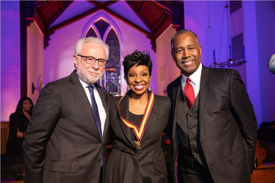
2019: CNN anchor Wolf Blitzer and Secretary of Housing and Urban Development, Dr. Ben Carson, presenting the Academy’s Gold Medal to the “Empress of Soul” Gladys Knight at Trinity Episcopal Church in Washington, Virginia.

The evening began with an inspiring performance in the village’s venerable Trinity Episcopal Church, featuring the international opera star Denyce Graves and rhythm-and-blues legend Gladys Knight. Following the concert, two members of the Academy’s Awards Council — CNN anchor Wolf Blitzer and the U.S. Secretary of Housing and Urban Development, Dr. Ben Carson — took the stage to present both world-renowned singers with the Gold Medal of the Academy of Achievement.