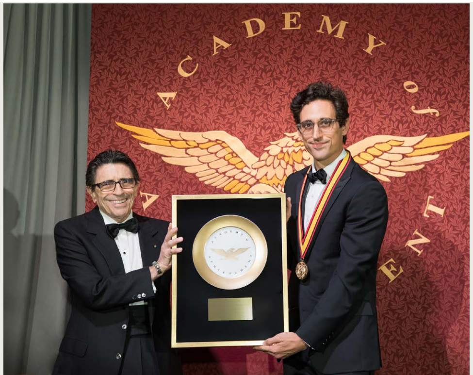
National Medal of Arts recipient Edward Villella presents the Golden Plate Award to Justin Peck, a recipient of the Tony Award for Choreography, at the Banquet of the Golden Plate gala held at the St. Regis Hotel in New York City.

Stevenson also led the drive to create the National Memorial for Peace and Justice in Montgomery, Alabama, commemorating thousands of victims of racist violence. The Great Migration of African Americans from the rural South to the urban North in the 20th century was a movement of refugees fleeing terror, he asserted, and called for America to embrace a narrative of truth and justice, and consciously come to terms with the crimes of the past, as Germany was forced to do after World War II and the Holocaust. “Injustice prevails where hopelessness persists,” he said. “The opposite of poverty is not wealth, but justice.”