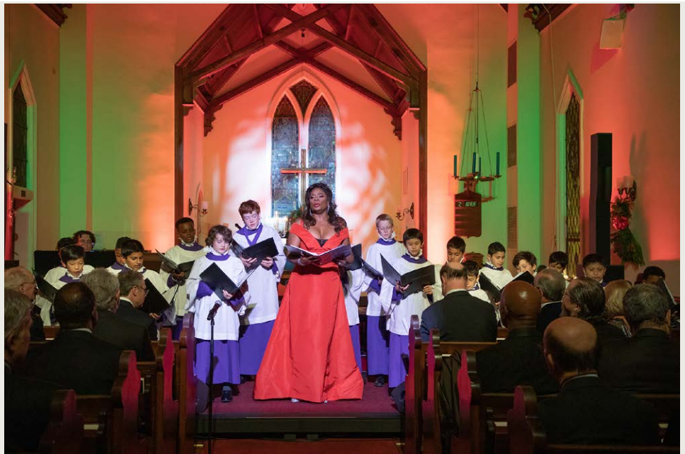
Denyce Graves and the Washington National Cathedral's Boys Choir sing "He's Got the Whole World in His Hands" at Trinity Episcopal prior to the Academy of Achievement's 2019 Holiday Dinner at the Inn at Little Washington.

Longtime Academy members, the honorees of the Academy's Class of 2019, and the Academy's young delegates will carry memories of a remarkable weekend in New York as they return to their respective endeavors. We hope that the exchange of ideas they enjoyed — and the formation of lasting bonds between men and women of many nations, young and old, across academic disciplines, professions and beliefs — will continue for many years to come.