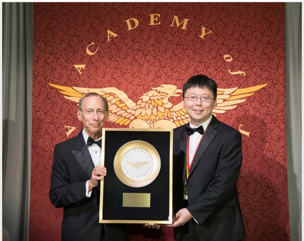
Dr. Robert S. Langer, Institute Professor at the Massachusetts Institute of Technology, presenting the Golden Plate Award to Dr. Feng Zhang, Co-Developer of CRISPR gene editing technology, during the 2019 Achievement Summit.

The Librarian of Congress, Dr. Carla Hayden — also the daughter of classical musicians — described herself as “an accidental librarian.” As a young liberal arts graduate, she spent her days in the library between job interviews, until a friend tipped her off about a job in a South Chicago branch library, where she was encouraged to get a graduate degree in library science. When President Obama asked her to assume leadership of the Library of Congress, the world’s largest library, he tasked her with making the treasures of the library more accessible to the public. She enumerated a few astonishing examples of the library’s vast holdings, including the contents of Lincoln’s pockets the night he died, and locks of hair from the heads of Thomas Jefferson and Ludwig van Beethoven.