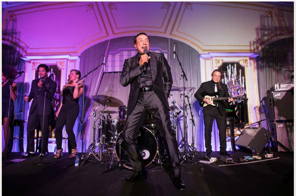
Smokey Robinson performs his classic songs to close the Banquet of the Golden Plate at the St. Regis ballroom.