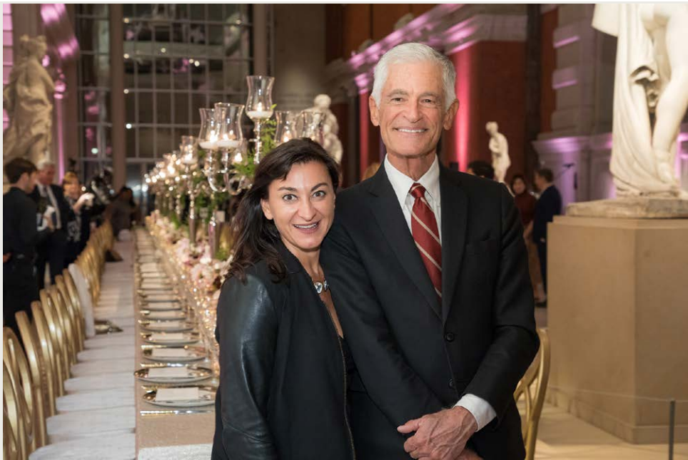
Two top photojournalists and war photographers: Lynsey Addario and James Nachtwey in the Carroll and Milton Petrie European Sculpture Court at The Metropolitan Museum of Art during the Achievement Summit in New York.

In his latest novel, Machines Like Me , he explores the ethical dilemmas raised by artificial intelligence. In his next, he borrows the premise of Franz Kafka's Metamorphosis , in which an ordinary man is mysteriously transformed into a giant insect, to create a satire of British politics in the era of Brexit. He pointed out that the relationship of the individual to the state is a perpetual subject of the novelist, and that novelists are among the first to be imprisoned by dictators when they seek to suppress dissent.