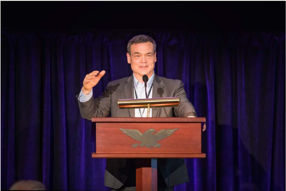
T.J. Stiles, the recipient of the Pulitzer Prize in Biography and History, addressing the Academy of Achievement delegates and members during a symposium session at the International Achievement Summit in New York City.

The first speaker of the Summit’s afternoon session, Paul Tudor Jones, founded the Tudor Group of investment companies, as well as Robin Hood, the New York-based foundation dedicated to directly addressing issues of childhood poverty in the nation’s largest city. Jones attributed many of society’s present ills to the identification of profit maximization as the sole responsibility of business management. Jones believes that the application of this philosophy to management justified a culture of unchecked greed that led to massive job outsourcing, the opioid crisis, and a 500-percent increase in wealth disparity since 1970. “Business is too important not to be an agent of change,” he said.