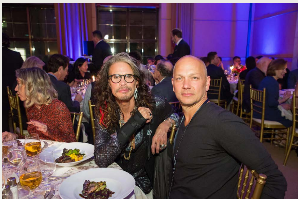
Aerosmith front man Steven Tyler and Tony Fadell, developer of the Apple iPod and Nest intelligent home devices.

At a time of nearly unprecedented political polarization, when public discourse frequently descends into rancorous bickering, the International Achievement Summit provides a unique opportunity for promising young men and women of different backgrounds, nations, beliefs, disciplines and persuasions to meet and learn from one another, and from the most accomplished practitioners in their fields.