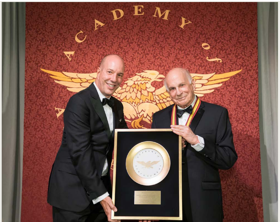
Anthony D. Romero, Executive Director of the American Civil Liberties Union, presenting the Golden Plate Award to Dr. Daniel Kahneman, a recipient of the Nobel Prize in Economics, at the 2019 International Achievement Summit.

Art of another kind came up for discussion as Steven Tyler, the lead singer of Aerosmith, took the stage. The child of a musical family, he recalled lying under the family piano as his father practiced scales overhead. Reflecting on his own early struggles to make it in the music business, he stressed the importance of finding collaborators. In Joe Perry and the other members of Aerosmith, he found comrades who were willing to sacrifice all else to pursue their dreams of musical glory. Reflecting on the excess of their early years, he quipped, “Of all the things I’ve ever lost, I miss my mind the most.” Taking questions from the audience, he said, “I got my dream — to make others happy, even when I wasn’t.”