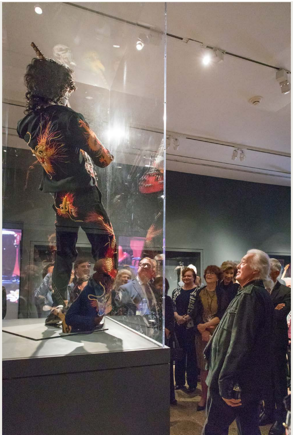
Jimmy Page addressing American Academy of Achievement members and special guests in front of a display of his 1975 dragon-embroidered costume and 1971 Gibson EDS-1275 Doubleneck. Page donated seven guitars, his stage outfits and equipment to the Play It Loud: Instruments of Rock & Roll exhibition at The Metropolitan Museum of Art.

The Sunday morning symposium began with a colorful visual presentation by Dr. Feng Zhang, a pioneer of CRISPR technology, the revolutionary gene-editing technique that is transforming the study of all living things. A former student delegate of the Academy of Achievement, he returned this year as an honoree. Now a