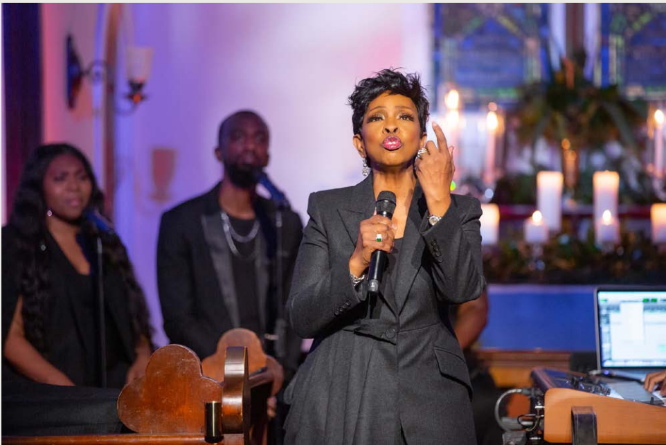
Gladys Knight performing a Gospel medley at Trinity Episcopal Church before the Academy's 2019 Holiday Dinner.

In the last weeks of 2019, two more distinguished honorees were inducted into the Academy during a festive holiday celebration in the historic village of Washington, Virginia, at the foot of the Blue Ridge Mountains.