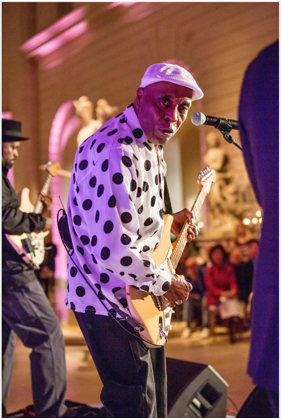
Legendary blues guitarist and singer George "Buddy" Guy, a recipient of the Grammy Lifetime Achievement Award, performing in the beautiful Carroll and Milton Petrie European Sculpture Court at The Metropolitan Museum of Art.