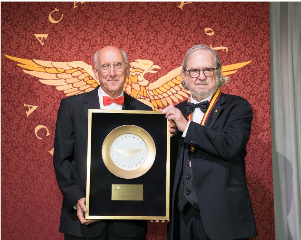
Dr. Steven A. Rosenberg, Chief of Surgery at the National Cancer Institute, presents the Golden Plate Award to Dr. James P. Allison, recipient of the Nobel Prize in Medicine, at the International Achievement Summit in New York.

The photojournalist James Nachtwey has spent his career documenting some of the most harrowing calamities of our times. Nachtwey illustrated his talk with stunning photographs from the world's war zones and disaster areas: the hellish orphanages of communist Romania; a famine-stricken wasteland in Sudan; the epidemic of birth defects in Vietnam, caused by exposure to Agent Orange; the ravages of the opioid epidemic across America; the horrors of war in Iraq and Afghanistan. He hopes that his photographs demystify euphemisms such as "boots on the ground" and "collateral damage." Photography, he said, allows the victims of these tragedies to say, "This happened to us here, in this place." He ended this sobering presentation with the words, "As we share these photos, we bear witness. Let us not forget."