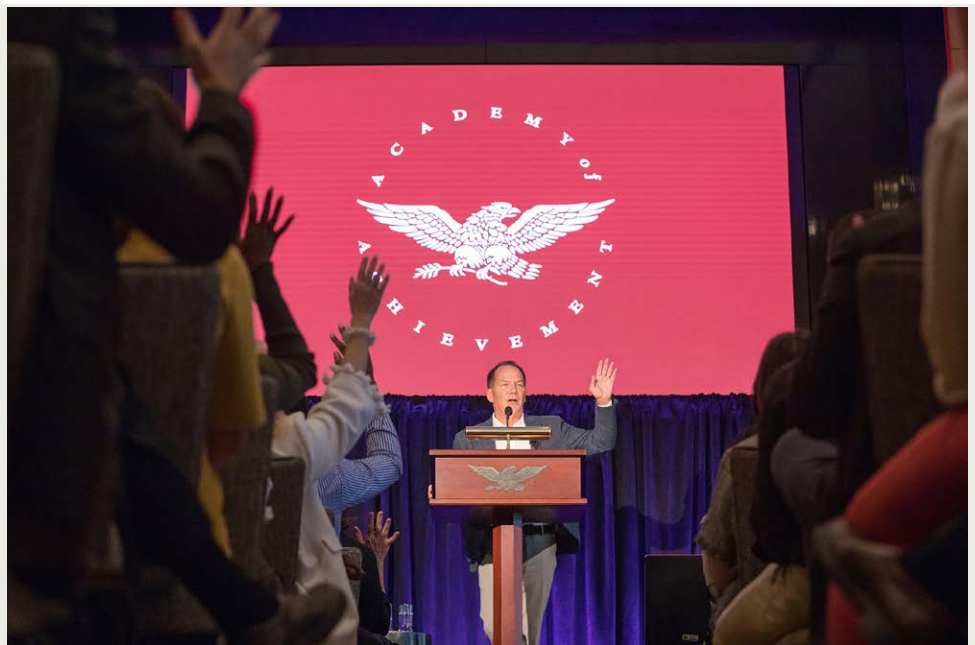
Founder of the Tudor Group and the Robin Hood Foundation, Paul Tudor Jones II, sharing his vision of “venture philanthropy” with the delegates and members at a symposium during the International Achievement Summit.

The pair reviewed Morrison’s early years as a blues musician and the development of his solo career as a singer and songwriter. Morrison disclosed that he decided to become his own producer when he “started reading the contracts” and decided he wanted to “own the means of production.” On reflection, he looked at all of his music and creative work as an effort “to create order out of chaos.” Morrison’s belief in poetry and music as fundamental values was evident throughout his blunt answers. As the conversation began with a reference to Robert Frost’s poem “The Road Not Taken,” it drew to a close with the first and last lines of T.S. Eliot’s Four Quartets — “In my beginning is my end... ...and in my end is my beginning.” The ever-laconic Morrison ended with the words, “Life is difficult; take it from there.”