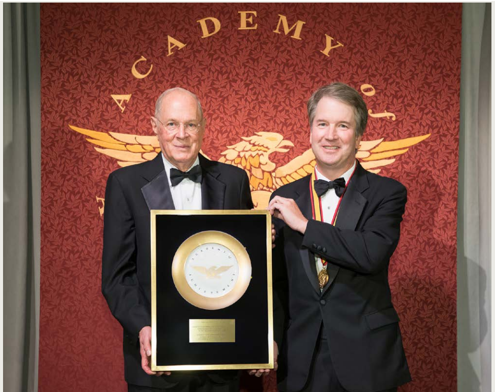
Awards Council member Justice Anthony M. Kennedy presenting the Golden Plate Award to Brett Kavanaugh, the Associate Justice of the United States Supreme Court, at the International Achievement Summit in New York City.

The final speaker of the Saturday morning session was Dr. Kip Thorne, whose theories and discoveries inspired the film Interstellar . Dr. Thorne received the Nobel Prize in Physics for his work leading to the discovery of gravitational waves — disturbances in the curvature of space-time. Thorne conceived the experimental framework for detecting gravitational events of this kind and campaigned forcefully for the construction of the Laser Interferometer Gravitational-Wave Observatory (LIGO). In his address to the Academy, Dr. Thorne recalled the skepticism he encountered on the way to building a 1,000-member team to staff the experimental facility. The first evidence of a gravitational wave, in 2016, confirmed a prediction Albert Einstein had made in his general theory of relativity 100 years earlier. Today, gravitational waves are observed on a regular basis and can be tracked on any smartphone with the app Gravity Events. An engaging and compelling speaker, Dr. Thorne easily conveyed the excitement of his area of astrophysical research.