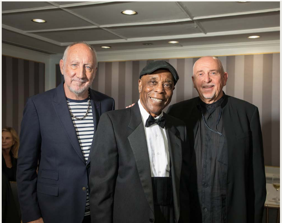
The Who's guitarist and songwriter Pete Townshend, bluesman Buddy Guy, and rock great Peter Gabriel meet at a reception at the Banquet of the Golden Plate at the St. Regis Hotel during the International Achievement Summit.

Since winning the Nobel Prize for Literature, the Turkish novelist Orhan Pamuk has often been asked why he writes. In his address to the Academy, he shared a list of reasons, ranging from “I write because I love the smell of ink and paper” to “I write because I am so angry at everyone.” In surveying the world today, he suggests that a fear of humiliation is the driving force behind many conflicts. A novel, he said, teaches “a secret hierarchy of values,” in the “childish hope” of finding that we all resemble one another more than we know. “I believe in the novel more than anything,” he said. “My religion is literature.”