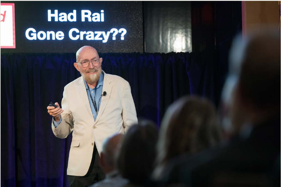
Dr. Kip Thorne, recipient of the Nobel Prize in Physics for his gravitational wave discoveries, addresses delegates.

After a video presentation reviewing Lord Lloyd Webber’s spectacular career, the man himself took the stage, where he took part in a brief conversation with the Pulitzer Prize-winning national correspondent of The Washington Post , Mary Jordan. Lord Lloyd Webber emphasized that his great success was essentially due to only undertaking projects that he cared about deeply and found personally exciting. He expressed concern about the current state of musical theater, noting the current predominance of “jukebox musicals” — composed of existing popular songs — over the traditional musical with a complete score of original music. In discussing the work of his foundation, he argued forcefully for the importance of music, art and drama to society as a whole.