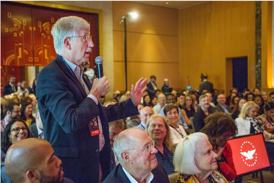
Dr. Francis S. Collins, Director of the National Institutes of Health (NIH), addressing gender equity in science policy.