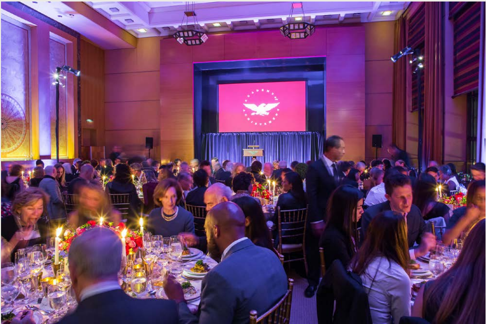
American Academy of Achievement members, honorees and delegates gather for the Introductory

In evening and daytime sessions of the Summit, also held at the Four Seasons, attendees engaged in intense colloquy over the pressing issues of the day, as well as matters of timeless significance.