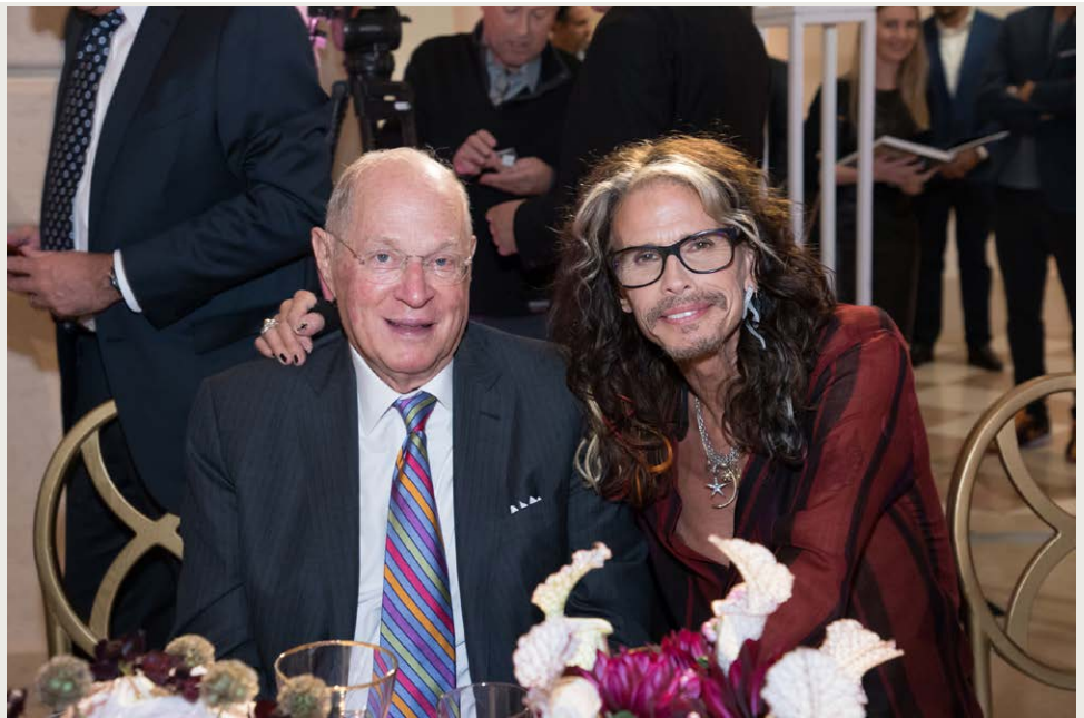
Anthony M. Kennedy, retired Justice of the United States Supreme Court, and Steven Tyler, a member of the Rock and Roll Hall of Fame and the Songwriters Hall of Fame, exchanging ideas at dinner at The Met during the Summit.

After the viewing of these, as well as musical treasures such as Louis Jordan's saxophone, Ringo Starr's drums, and the piano played on tour by Jerry Lee Lewis, the assembly gathered for an intimate dinner in the museum's Carroll and Milton Petrie European Sculpture Court. In the shadow of Canova's monumental statue of Perseus and other masterpieces of the classical tradition, Academy members were treated to a performance by blues master Buddy Guy. "I was born to play guitar..." he sang, and proved it with a typically intricate and soulful display of fretboard wizardry.