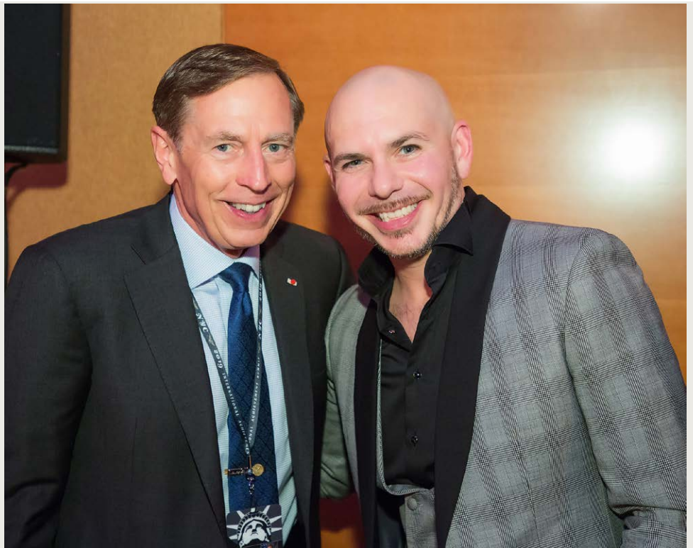
General David H. Petraeus, former Director of the Central Intelligence Agency, meets rapper, singer, songwriter and producer Armando Christian Pérez, known professionally as “Pitbull,” at the International Achievement Summit.

Delegates attending the Summit for the first time included Soros Fellows, MacArthur Fellows, fellows of the MIT Media Lab, young physicians and researchers from the Harvard-MIT Medical Scientist Training Program, startup entrepreneurs from Silicon Valley, a promising novelist from Nigeria, a city council member from Houston, the minority leader of Alabama’s House of Representatives, and the lieutenant governor of Wisconsin.