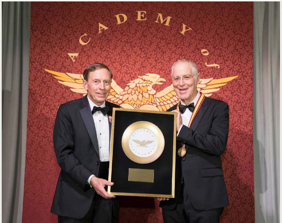
Awards Council member General David H. Petraeus presents the Golden Plate Award to Ron Chernow, the Pulitzer Prize-winning author of the biography Alexander Hamilton , during the 53rd annual Banquet of the Golden Plate.

Recipients of the Pulitzer Prize included historian Rick Atkinson and biographers A. Scott Berg, Ron Chernow and T.J. Stiles; former Poet Laureate of the United States Rita Dove; playwright Lynn Nottage ; and photojournalist Lynsey Addario, who was joined by the award-winning war correspondent and photojournalist James Nachtwey.