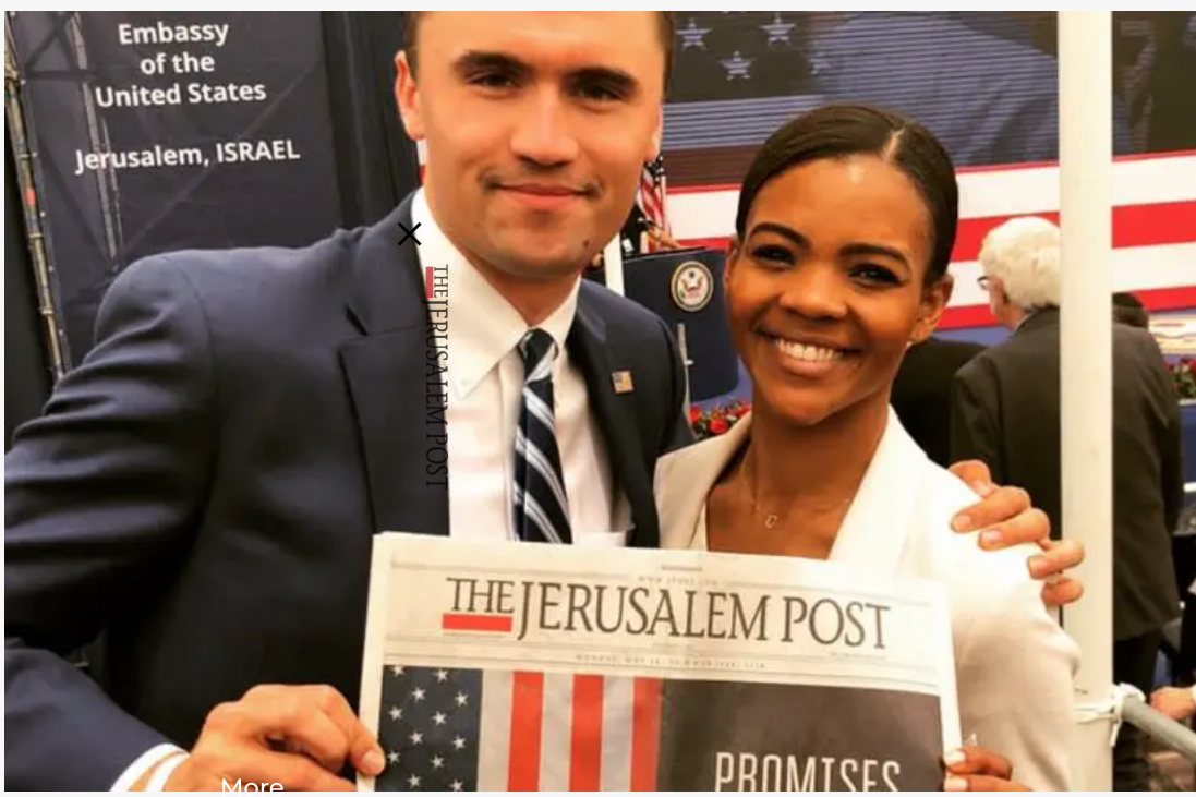
Candace Owens (R) and Charlie Kirk (L) holding a copy of The Jerusalem Post