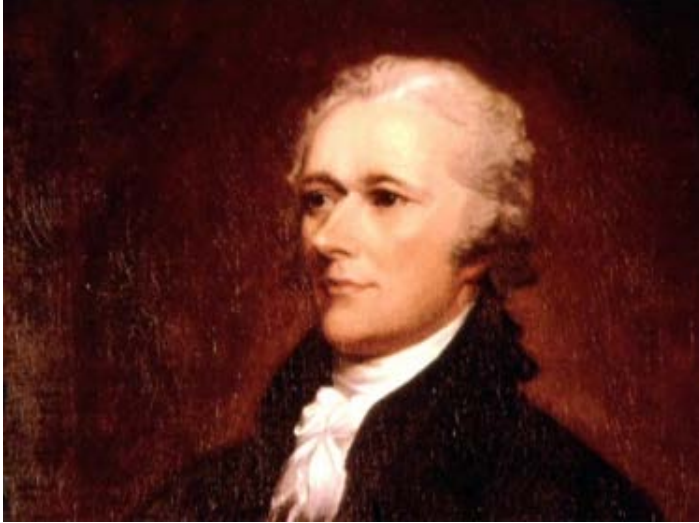
[ Alexander Hamilton (b. 1757- d. 1804) ]