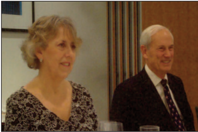
Baroness Manningham-Buller, Admiral Lord Boyce

Following the Annual Meeting on 30 September, Pilgrims and their guests attended the 20 th Sir Harry Brittain Memorial Lecture as guests of KPMG LLP in the atrium at 8 Salisbury Square. Baroness Manningham-Buller DCB, Director-General of the Security Service 2002-07, achieved distinction as a counter-terrorism specialist working against the IRA and international terrorist groups.