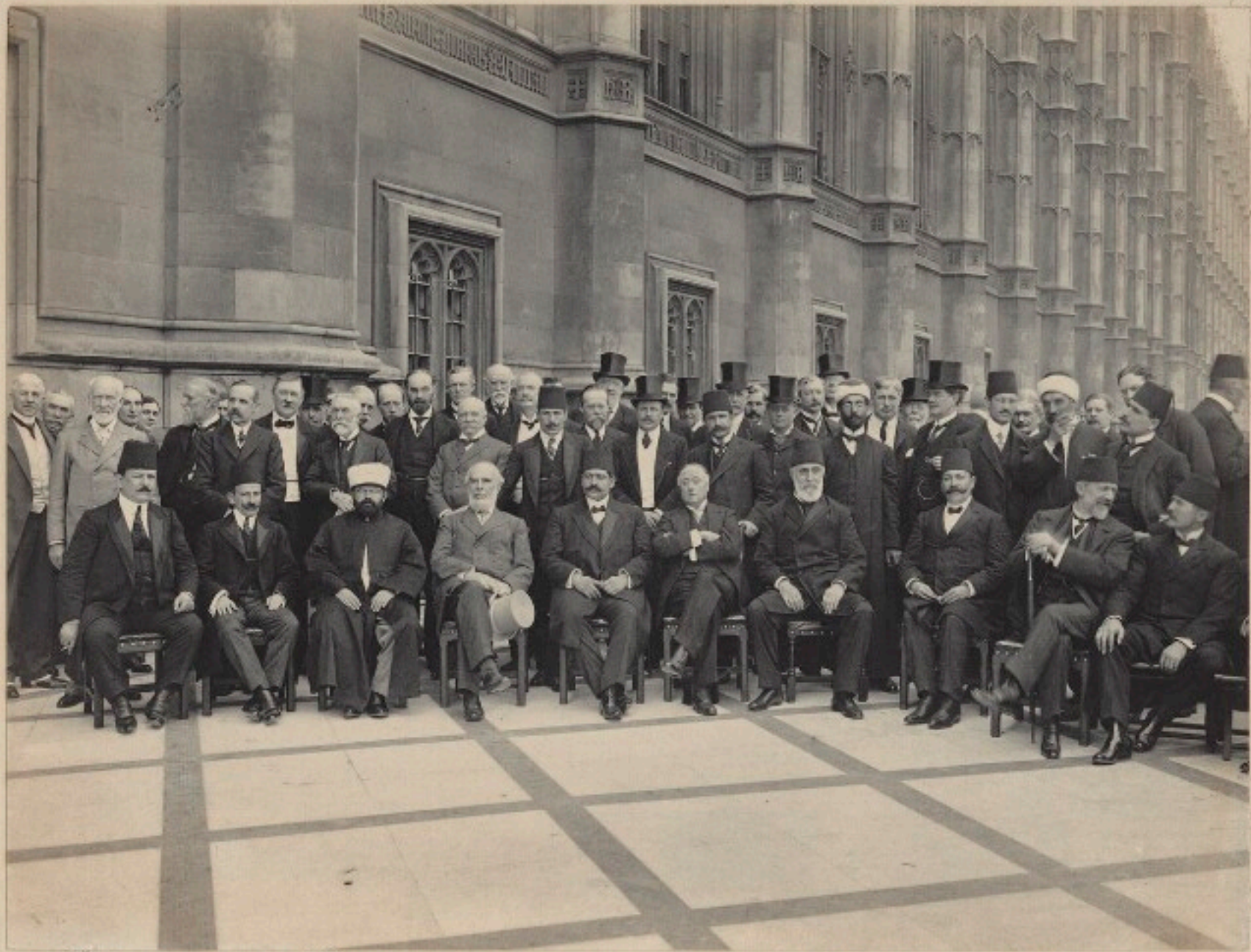
Luncheon Party at the Houses of Parliament to receive the Delegates from the Imperial Ottoman Parliament by the Inter-national Parliamentary Union (British Group) July 21 st 1909