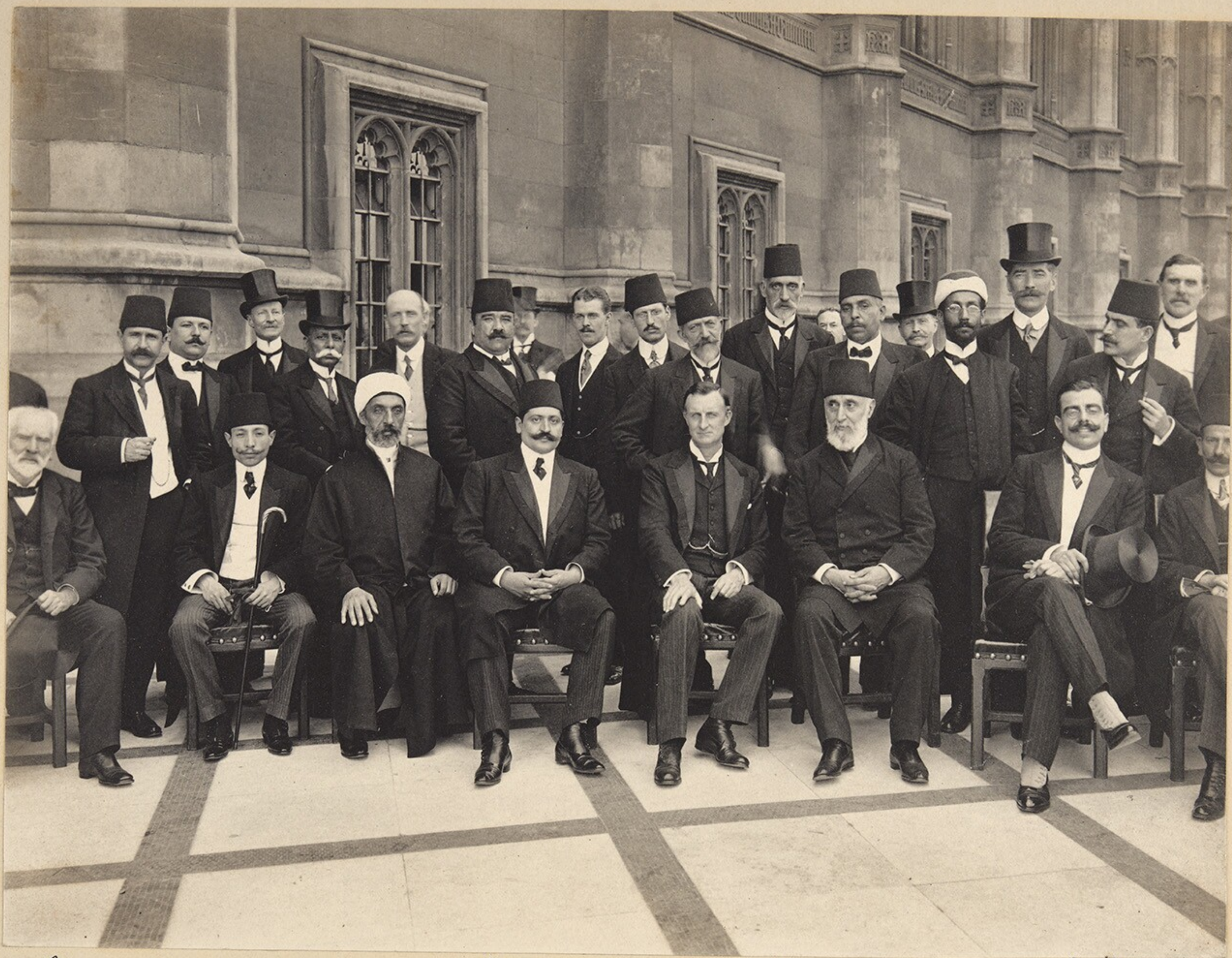
Luncheon party to the Delegates of the Imperial Ottoman Parliament, at the House of Commons. July 21 st 1909. J. Benjamin Stone