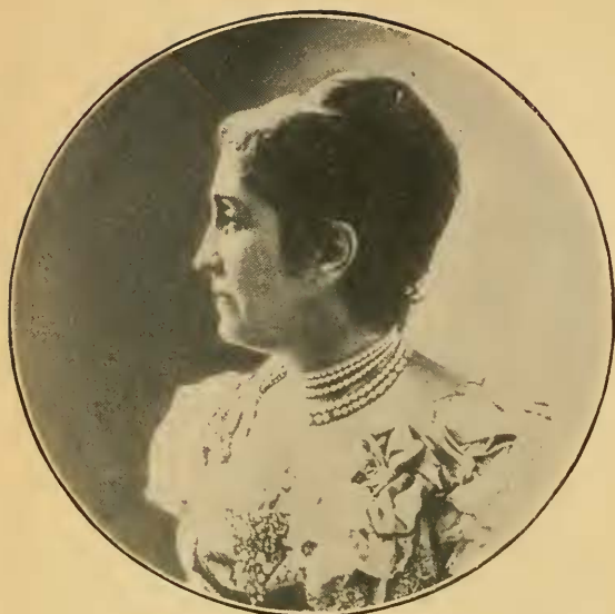
Mr. Hearst's Mother.

entering upon the description of Mr. Hearst's remarkable personality, let me administer to John Bull a little salutary physic in order that he may attain to what Thomas à Kempis calls "the highest and most profitable knowledge truly to know and to despise ourselves."