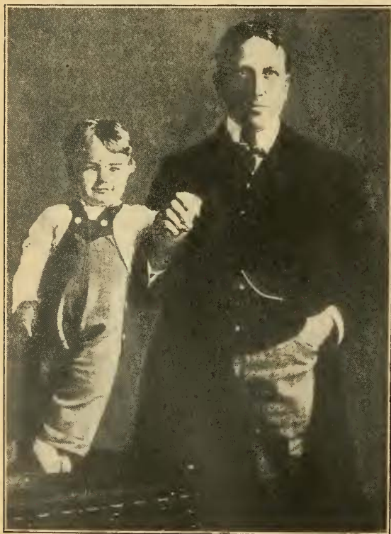
Mr. Hearst and his Son

The facts of his meteoric career are soon told. He is the son of the great millionaire mineowner, of California Senator Hearst, whose wife, Phœbe, still survives. He was born in 1864. He was sent up to Harvard by his parents, and he was sent down from Harvard by the University authorities. After returning to S