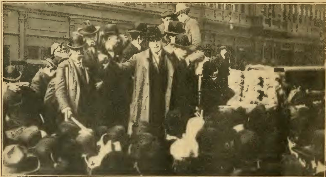
Mr. Hearst delivering a Stump Speech in the Campaign of 1906.

Here there is an Imperium in imperio , a power within the Republic which Mr. Hearst has now revealed as directly aiming at the control of the Government of the Republic by the use of the money power.