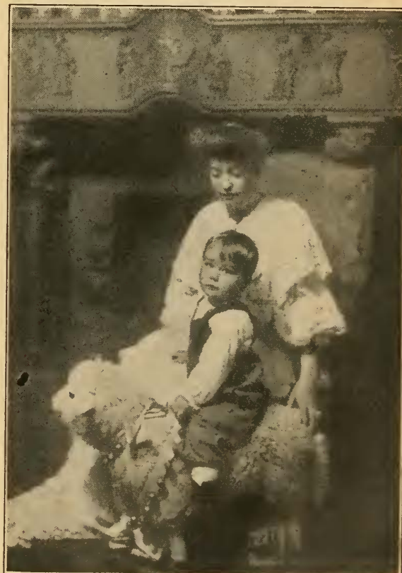
Mrs. W. R. Hearst and the Boy.

black as his face, leaned over and gripped Mr. Hearst's fingers and shouted, "Good boy ! To hell with the Coal Trust, Willie !"