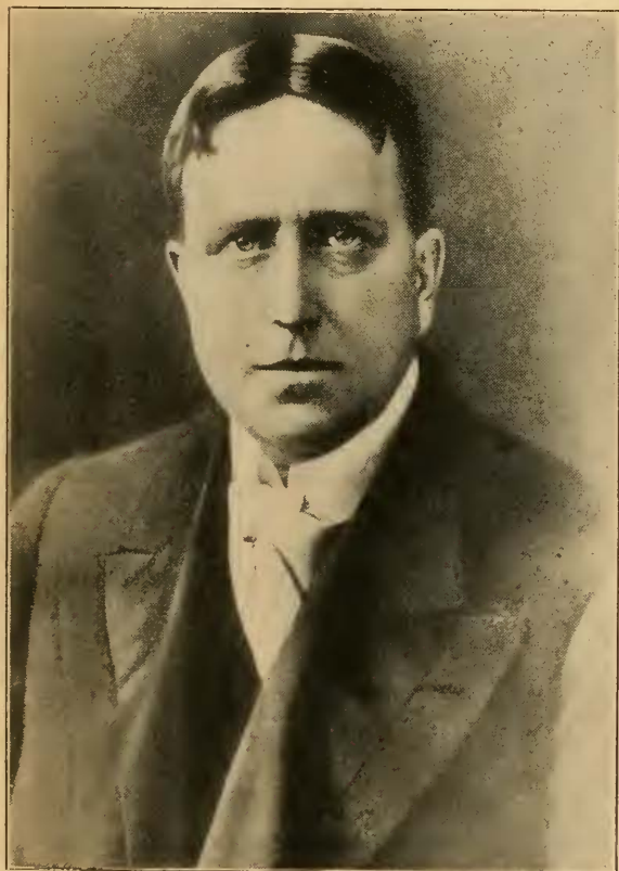
A Characteristic Portrait.

of the West—been giving the Trusts hell all round. And not the Trusts only. The politicians who have blackmailed the Trusts, and the political leaders who became the hirelings of the Trusts, have all received their medicine. Republican and Democrat alike have had it meted out to them fiery hot, while all the world has wondered, and not a few of its denizens