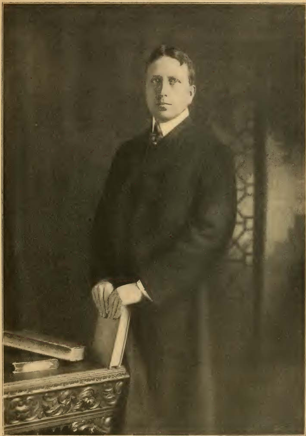
MR. W. R. HEARST.