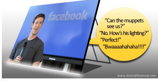
\textbf{Fig. 3} - \text{Is Mark Zuckerberg propped up like a } \underline{ \text{Potemkin Village?} }

out. Is Summers calling in markers to help his political associates?