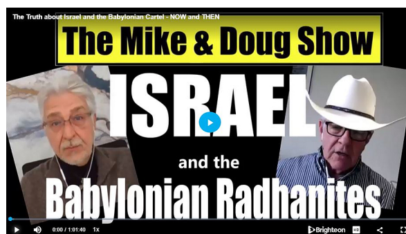
Fig. 2 - Gabriel, McKibben. (Oct. 09, 2023) . Israel and the Babylonian Radhanite merchant-bankers. AIM, AFI. Source: Raw *.mp4 video file . See All Wars are Bankers' Wars .

Bookmark= #israel-and-babylonian-radhanites , https://tinyurl.com/4er683ruTINY