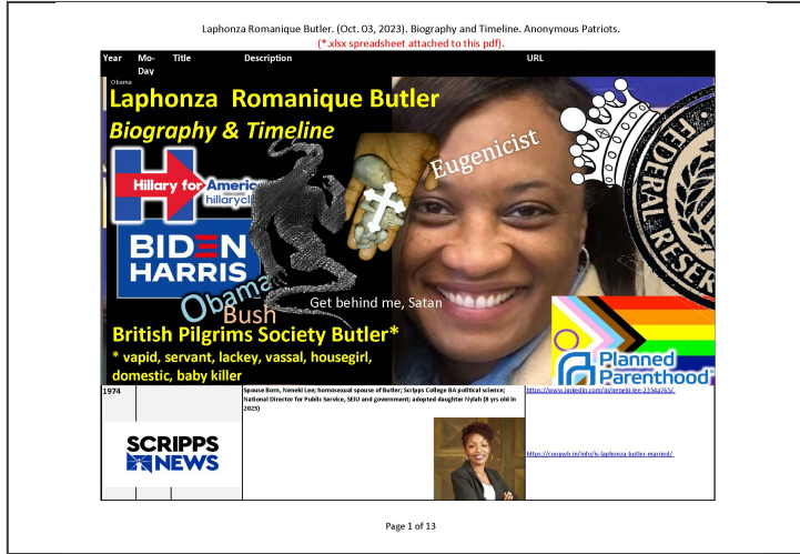
Fig. 3— Laphonza Romanique Butler. (Compiled Oct. 03, 2023) . Biography and Timeline. Anonymous Patriots. (2.3 MB). Contains links to the source material.